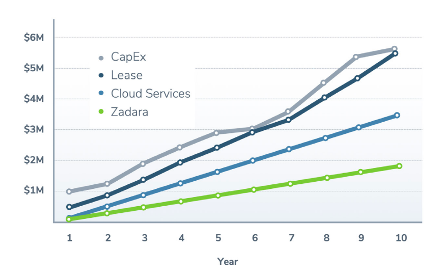
*Source: "The Zadara Storage Cloud – A Validation of it Use Cases and Economic Benefits", The Evaluator Group.

Zadara has a lower total cost of ownership, up front and over the long term. An independent study* by The Evaluator Group finds that Zadara provides greater than 50 percent savings over traditional CapEx storage, and large savings over cloud services. And these differences persist over a ten-year period, adding up to substantial cumulative savings over every other form of storage.